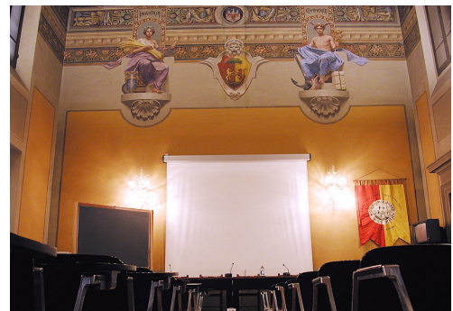
Images of Casa Matha, Ravenna, workshop venue